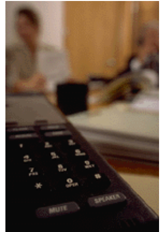
Caption describing picture or graphic.

can also be used for your Web site. Microsoft Publisher offers a simple way to convert your newsletter to a Web publication. So, when you're finished writing your newsletter, convert it to a Web site and post it.