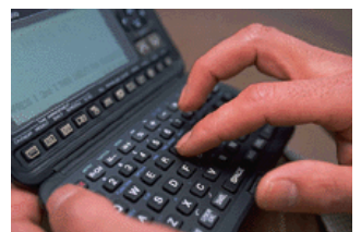
Caption describing picture or graphic.

If space is available, this is a good place to insert a clip art image or some other graphic.